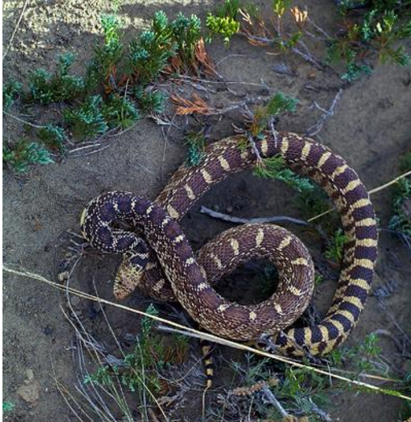
Bull snake