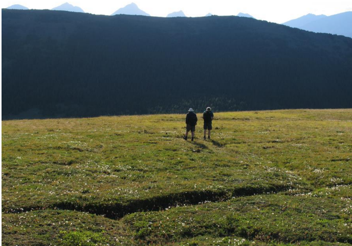
Fossil ice wedges