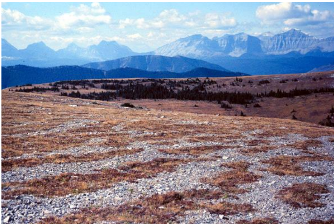
Alberta Parks website