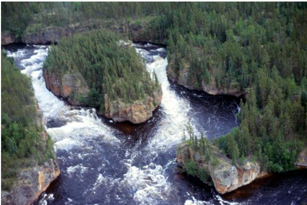
Alberta Parks website