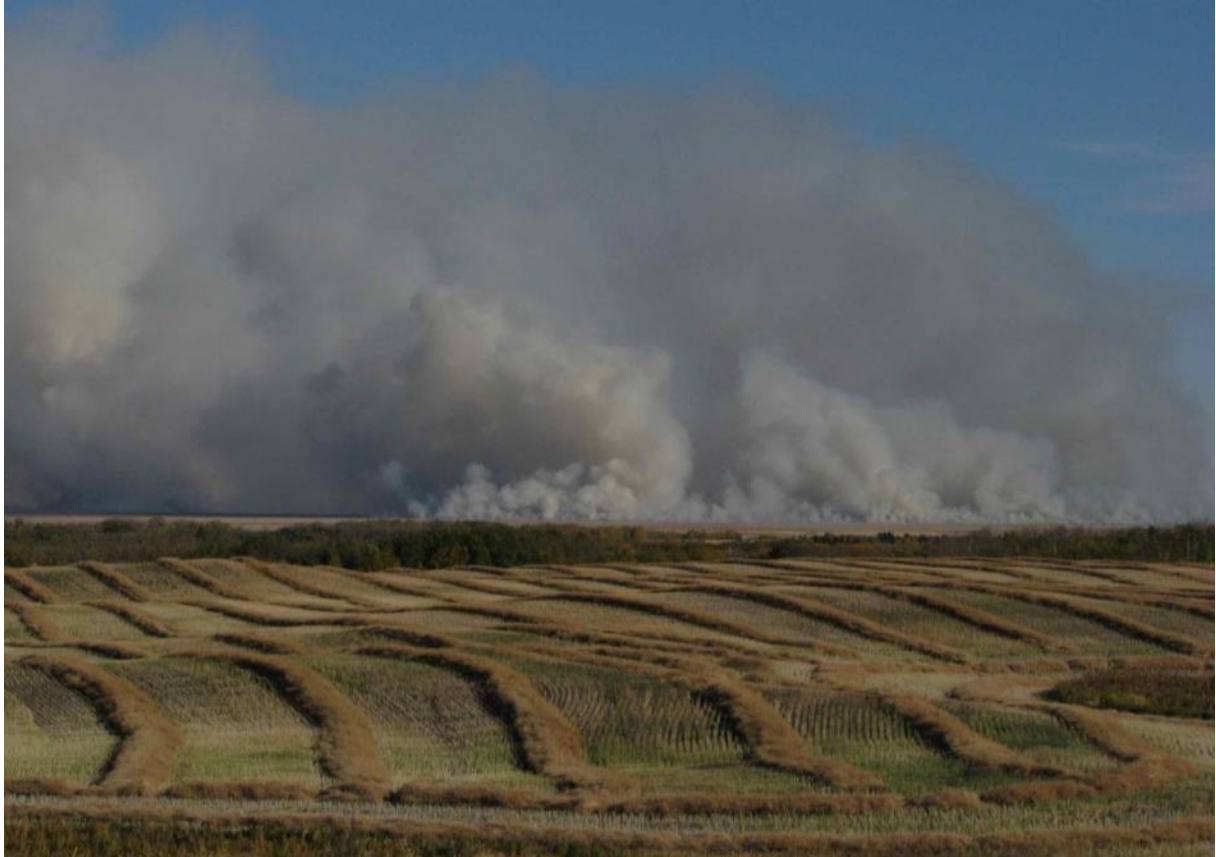
Spring wildfire on Beaverhill Lake