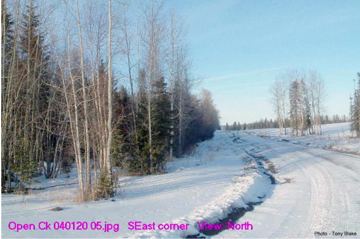
Open Ck 040120 05.jpg SEast corner View: North