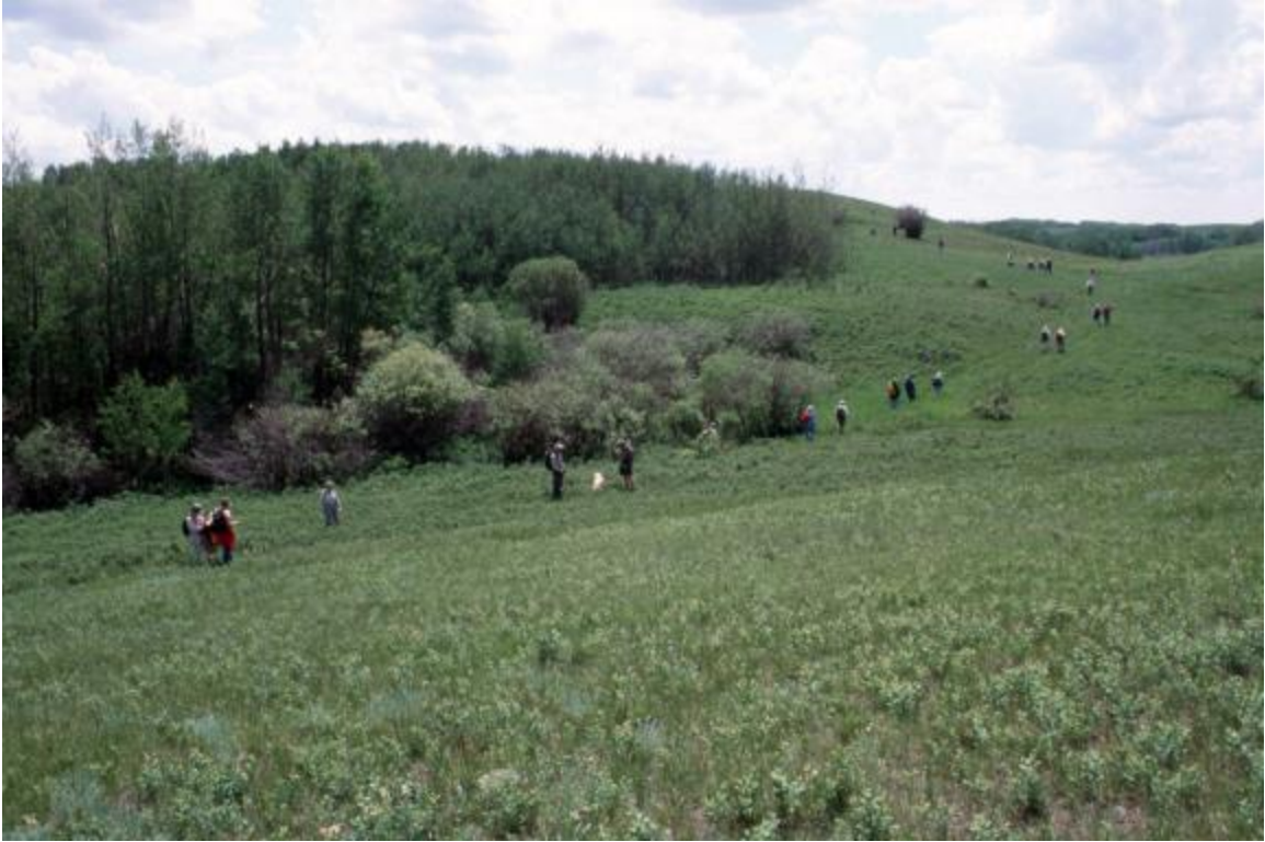
Botany Alberta outing to Rumsey in 2002 - photo L. Kershaw