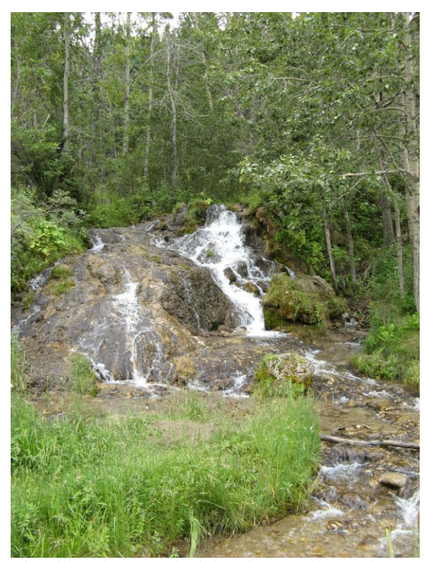
Big Hill Springs Provincial Park, a small park that protects a tufa-forming calcareous spring and stream, is well-visited by Calgarians.