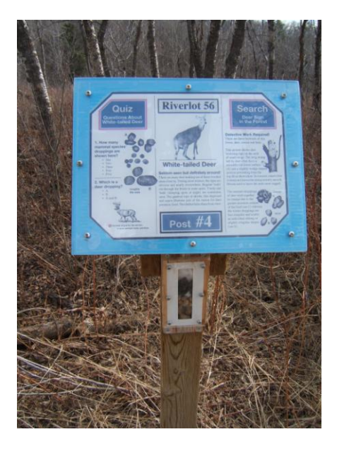
Interpretive sign at Riverlot 56 Natural Area (installed by stewards).

A new plan and legislation for parks, together with new regional planning, have created a situation of uncertainty regarding the fate, management and stewardship of Alberta's established protected areas. This applies particularly to Alberta's Natural Areas (NAs) which have the least protection of all its categories of protected area.