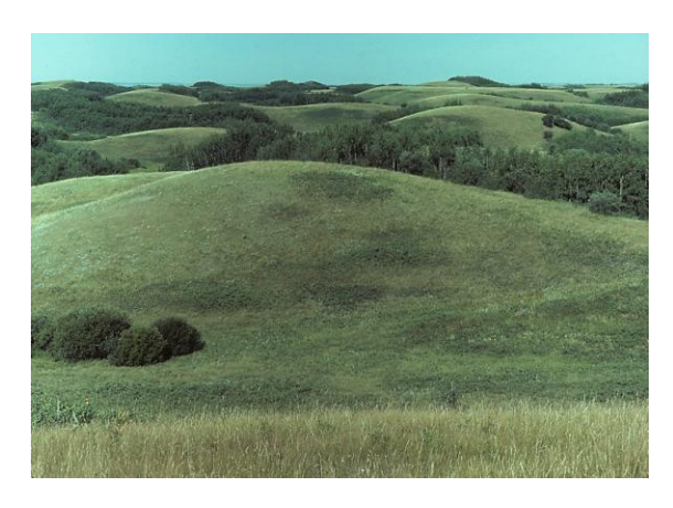
Central aspen parkland at Rumsey Ecological Reserve.

activity and settlement, but will minimize largescale industrial and urban development. Examples of this are the Beaver Hills Initiative (on the Cooking Lake Moraine) east of Edmonton, and the Red Deer River Natural Area extending from Buffalo Lake Provincial Park in the north, to Dry Island Buffalo Jump Provincial Park in the south, and Rumsey Ecological Reserve and Natural Area in the east. Both these models include multiple partners and jurisdictions and cover large swaths of ecologically important land. Some of the conservation areas to be established under the LUF plans may well be of this nature too.