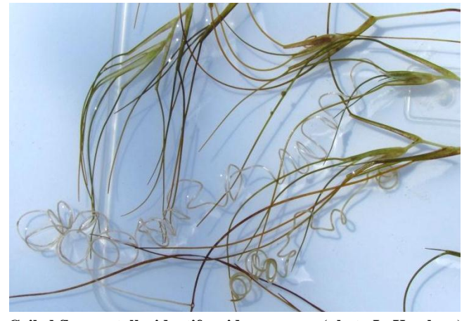
Coiled flower stalks identify widgeon-grass

We're usually away for the field season, so I rarely get a chance to canoe across Hastings Lake to our natural area in the summer. This summer I was home for a few days with family, and we decided to go for a paddle on the lake. Imagine my surprise when I discovered a large population of the rare aquatic plant, widgeon-grass ( Ruppia cirrhosa ) growing all around the islands of Hastings Lake Islands Natural Area and along the shore of Hastings Lake Natural Area. I had been looking for this plant for years, and it was right in my back yard.