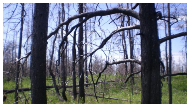
Remains after fire at North Bruderheim NA

Sundre. Then in June another meeting gave me a chance to briefly see the Hastings Lake and North Cooking Lake Natural Areas on my way to explore North Bruderheim Natural Area with other stewards.