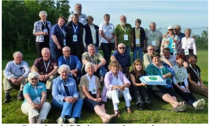
Stewards and AB Parks personnel, past and present

This was followed by lunch, courtesy of Alberta Parks, and in the afternoon everyone participated in break-out sessions discussing some of the challenges of working in protected areas. Coral Grove presented a photo overview of 25 years of volunteers and then handed out pins to the attendees, many of whom had been involved in the program since its inception. The day ended with a delicious banquet, and time to socialize outside on a perfect summer day.