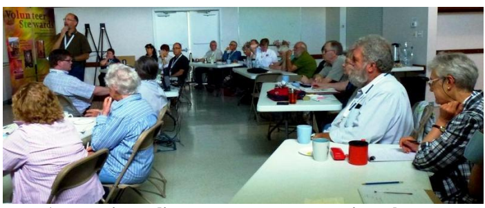
An attentive audience gets answers to questions about stewardship concerns

The purpose of the new Parks Act will be 'to protect for future generations.' An important question was raised regarding whether the Purpose should also include the need to respect the intrinsic value of maintaining ecological integrity. The government's first goal (listed first but not necessarily the highest priority) is to protect ecosystems, habitat, biodiversity and watersheds. Other goals include connecting Albertans to nature through education and stewardship, and by providing a broad range of outdoor nature-based recreational opportunities.