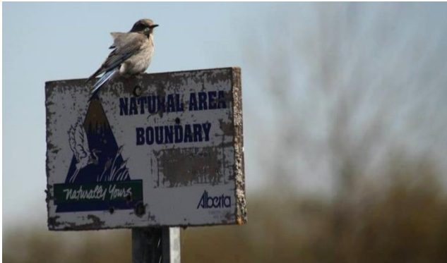
Beaverhill NA (Irene Crosland)