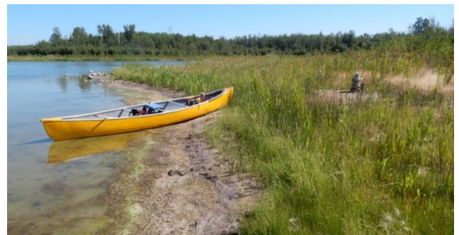
Sandy landing at Edgar T. Jones NA