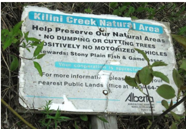
Kilini Creek