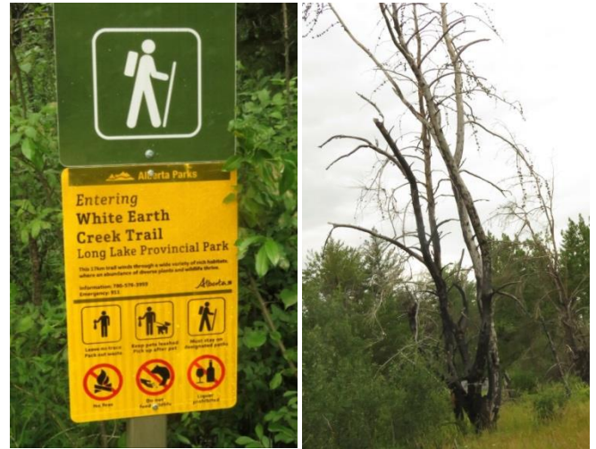
White Earth Valley Northwest of Bruderheim (H. Taube)