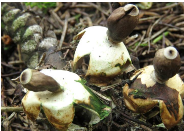
Four-footed earthstar ( Geastrum quadrifidum ), an unusual fungus at Miquelon Lake PP (H. Taube)