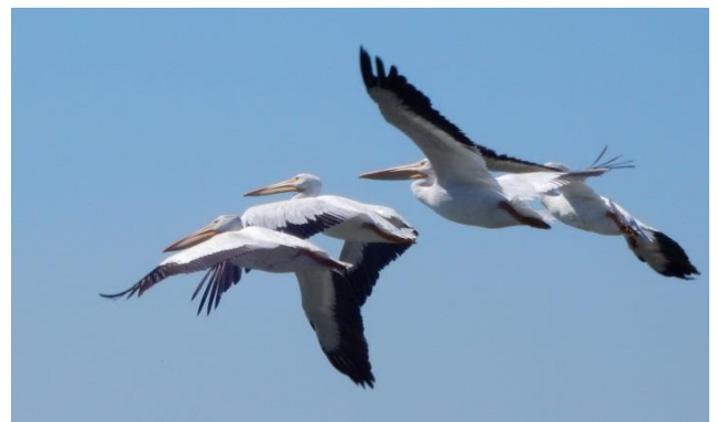
Pelicans at Hastings Lake NA